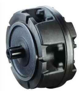
Ordering Code for standard GM motor Size: