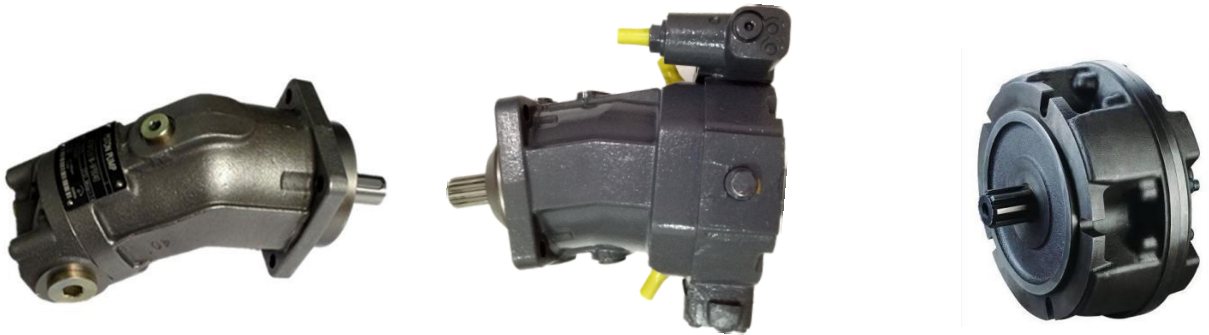
FIXED & VARIABLE PISTON MOTORS