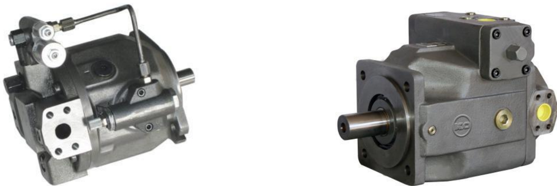
VARIABLE PISTON PUMPS

Findway Hydraulic Source carry a wide variety of reman & aftermarket piston pumps & motors from a variety of manufacturers including Rexroth®, SAI®, Sundstrand®, Eaton®, Vickers®, Denison®, Parker®, and many others. Both our reman and aftermarket units are built with parts that meet or exceed OEM spec and are fully tested before they leave our facilities.